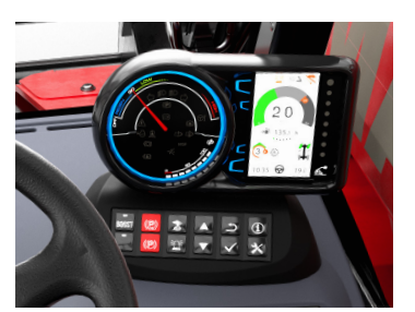
Intuitive display 22 languages