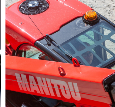
Access to the videos of handling using the QR Code. Reduce Risks supports you in the use of your machine.