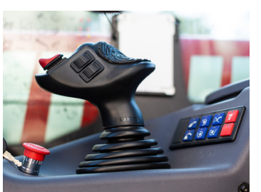
JSM ergonomic For maximum comfort