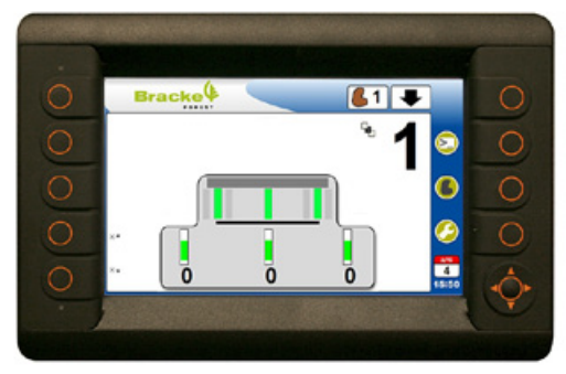
The Control system is PLC based.