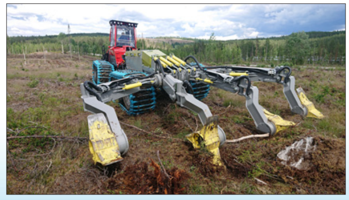
Scarification with the M46.b gives plants and seeds the best possible start for growth and survival whatever the terrain.