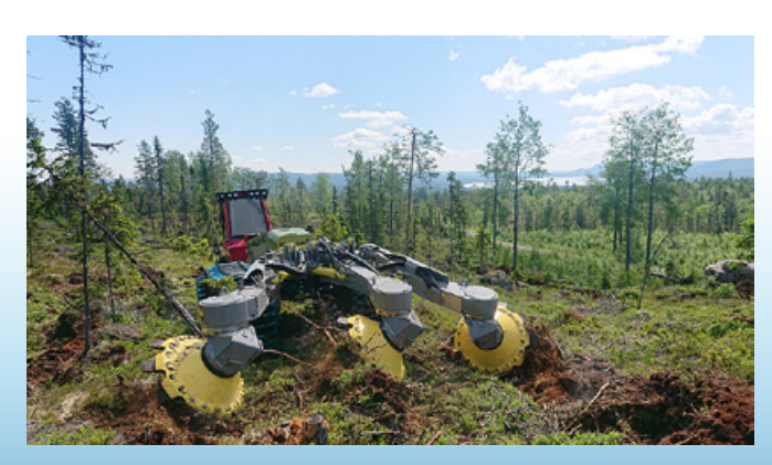
The Bracke T35.b is suitable for large scarification objects and is mounted on large prime movers.