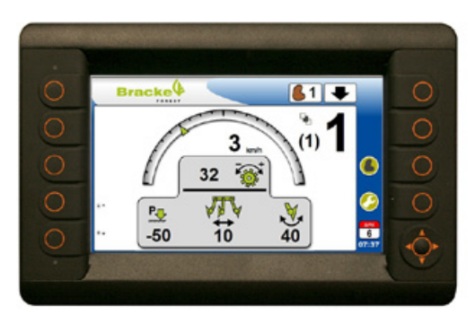
The control system is PLC-based.